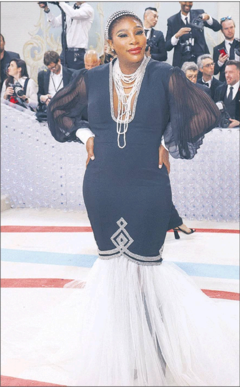
MUMS THE WORD: Serena Williams poses at the Met Gala, an annual fundraising event held for the benefit of the Metropolitan Museum of Art's Costume Institute, in New York on Monday. Serena confirmed at the event she is expecting her second child, telling reporters that there were "three of us" on the red carpet, where she arrived with husband Alexis Ohanian.