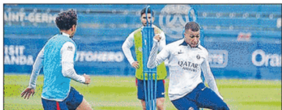
The picture shared on Twitter by PSG shows Kylian Mbappe (right) and teammates during a training session on Friday