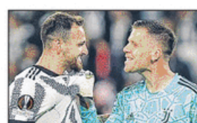
Juventus' Federico Gatti (left) and Wojciech Szczesny on Thursday.

Rome: AS Roma grabbed a 1-0 home victory over Bayer Leverkusen in their Europa League semi-final first leg on Thursday, thanks to 20-year-old Edoardo Bove's second-half goal.